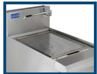
Perforated Steam Plate