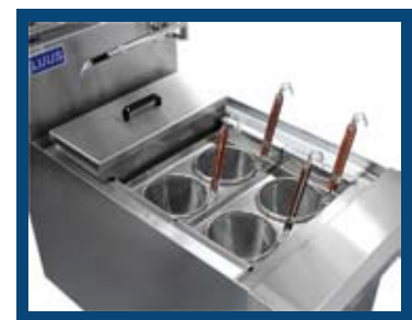
Different Options Available