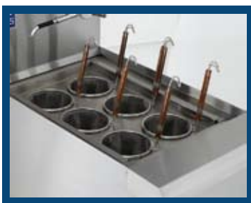
Stainless Steel Finish