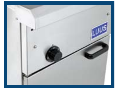
External Thermostat Controls