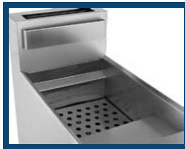
Stainless Steel Tank