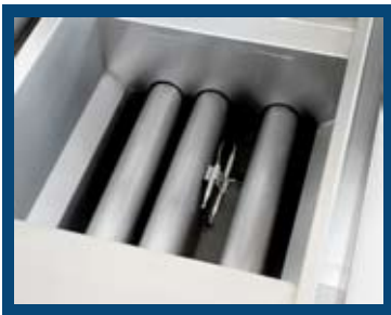
Tube Burner System